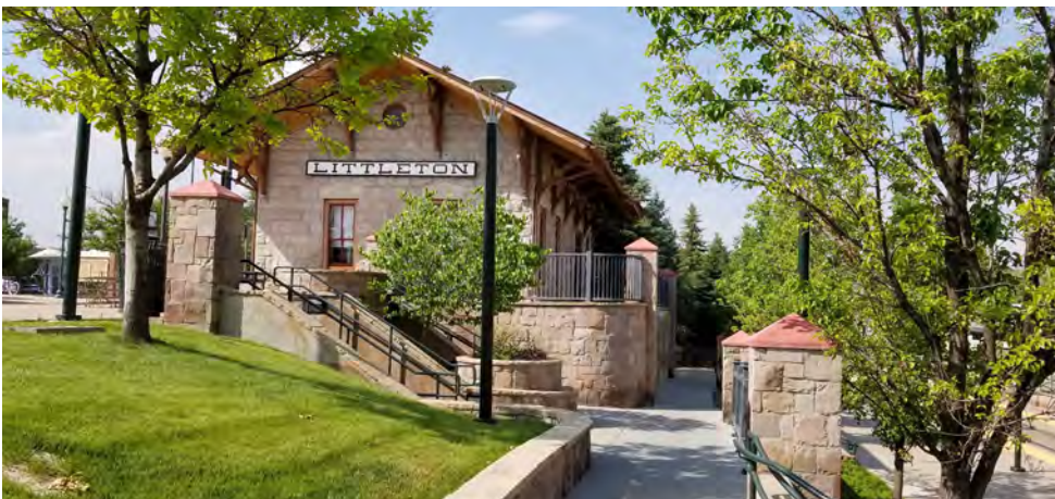
Littleton Light Rail Park 'n Ride Station