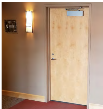
Unit 115 Interior Entrance by the Restroom