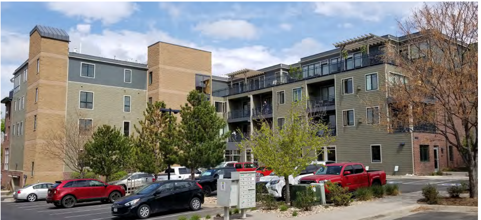
Alley Exposure with Rear Building Lobby Entrance and Surface Parking Lot