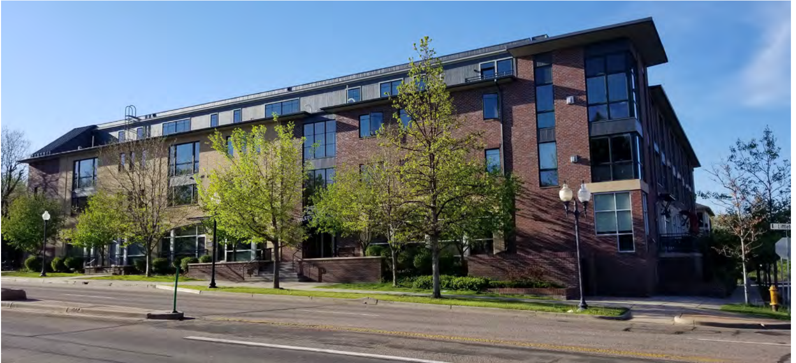
Littleton Boulevard Exposure with Front Entrances

Office Condo Suite 115, Littleton Station Building 1950 W. Littleton Blvd., Littleton CO 80120