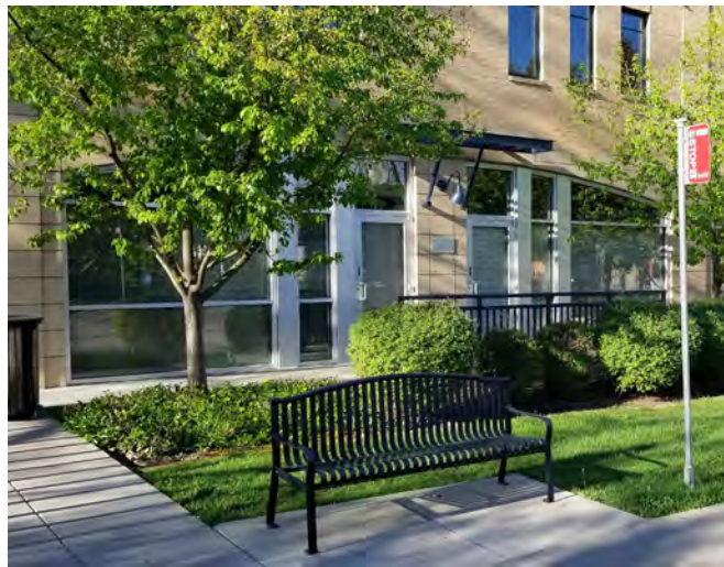
Unit 115 Exterior Entrance by the Bus Stop